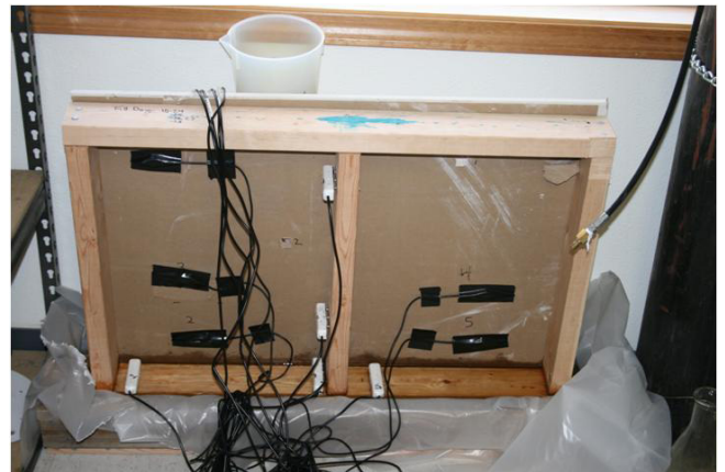
Figure 1. Test setup showing water activity sensors placed at different heights on wallboard suspended in water.

Gypsum wallboard was obtained from a local supply store and used to assemble a 61 x 51 cm wall. The wall frame was composed of fir two-by-four studs and the wallboard was unaltered -5/8 inch gypsum with no covering. The wall was placed in a plastic-lined trough containing 7.6 cm depth of tap-water (Figure 1). After all sensors had reached their peak water activity value, the wall was taken back out of the water and allowed to dry.