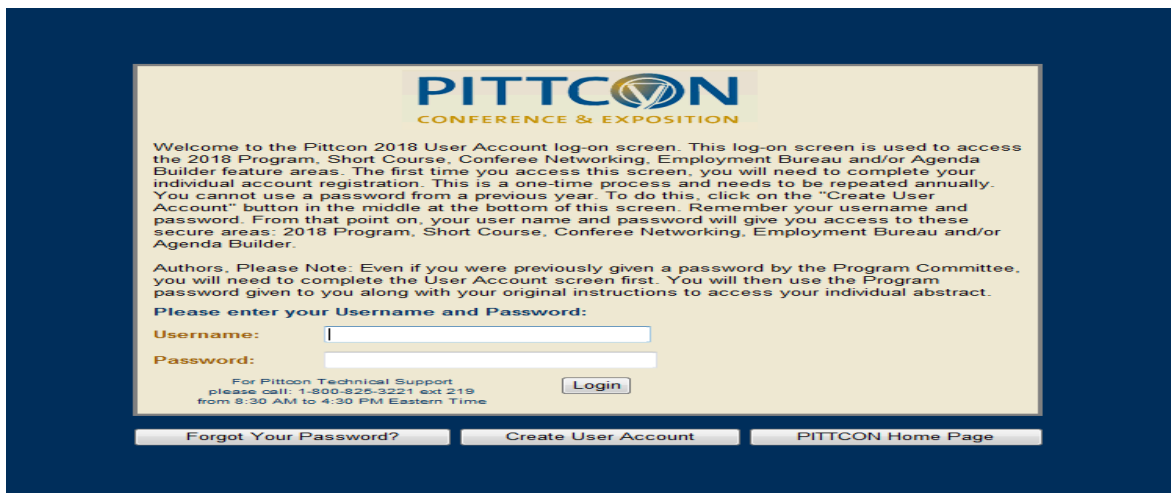
FIGURE 1: Initial Login Screen