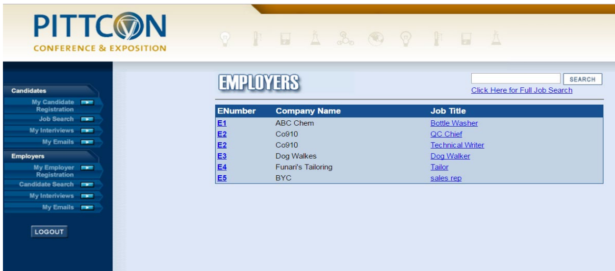
FIGURE 7: Candidate Screen for Full Text Searches