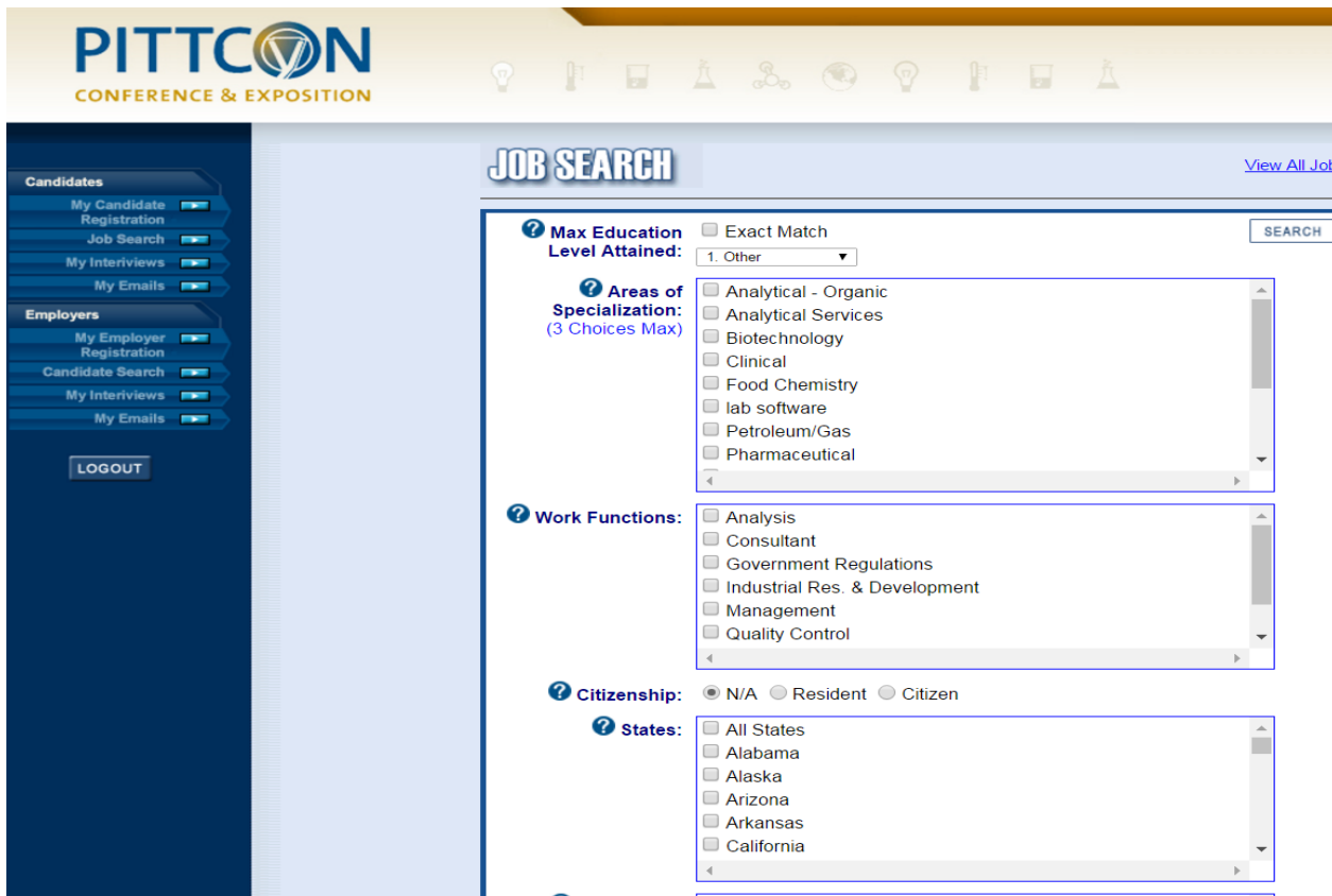
FIGURE 6: Screen for Accessing Searches, Profiles, Emails and Interviews